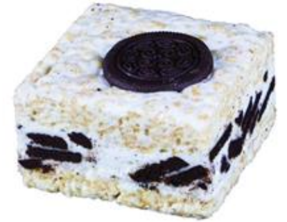
Cookies & Cream