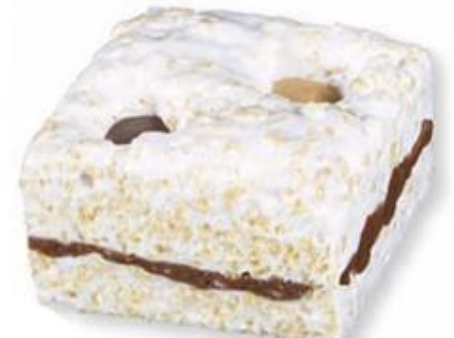
Peanut Butter Chocolate