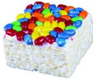
Easter Jelly Bean