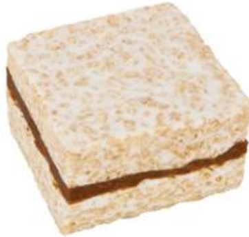
Carmel & Cream