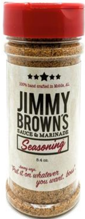
All Purpose Seasoning